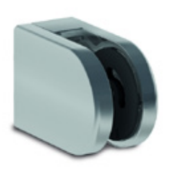
Flat back Glass Clamp