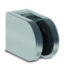
Flat back Glass Clamp