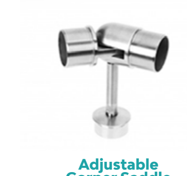
Adjustable Corner Saddle